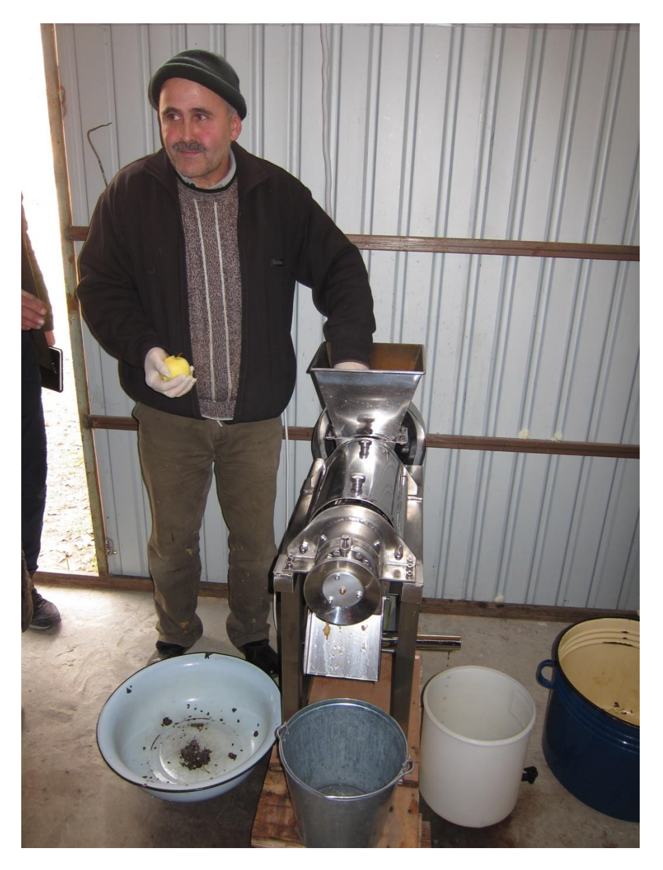
Fig. 4. Fruit processing IGA enterprise in Khorog: Production of apple juice.

All ANRM sub-projects are completed and handed over to the relevant government authorities and Community-Based Organisations (CBOs) for use and maintenance. All 29 IGA sub-projects are realised (see Fig. 4). While the IGA subprojects have created additional incomes and may provide new jobs, the integration of DRR elements in their activities are not given in each case. However, we feel that the grant recipients could be more actively involved in DRR awareness-raising. They could use their production facility, which is often a meeting point, to attract the interest of visitors to project activities by hanging illustrative posters with key messages on the walls. An excellent opportunity for awareness-raising would be to use the mobile-café for this purpose.