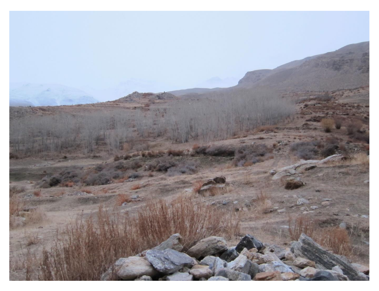
Fig. 2. The rehabilitation of the access road in 2018 to the alp of Barvoz village has greatly facilitated the use of pasture, arable land and forests and the marketing of their products.

The project has promoted a gender approach in the establishment of LUC's and PUG's and in the development of LUP's and PLMP's. Due to the massive male outmigration, women have taken key roles in LUC's and PUG's and income generating activities. The project staff of AKAH is gender-balanced.