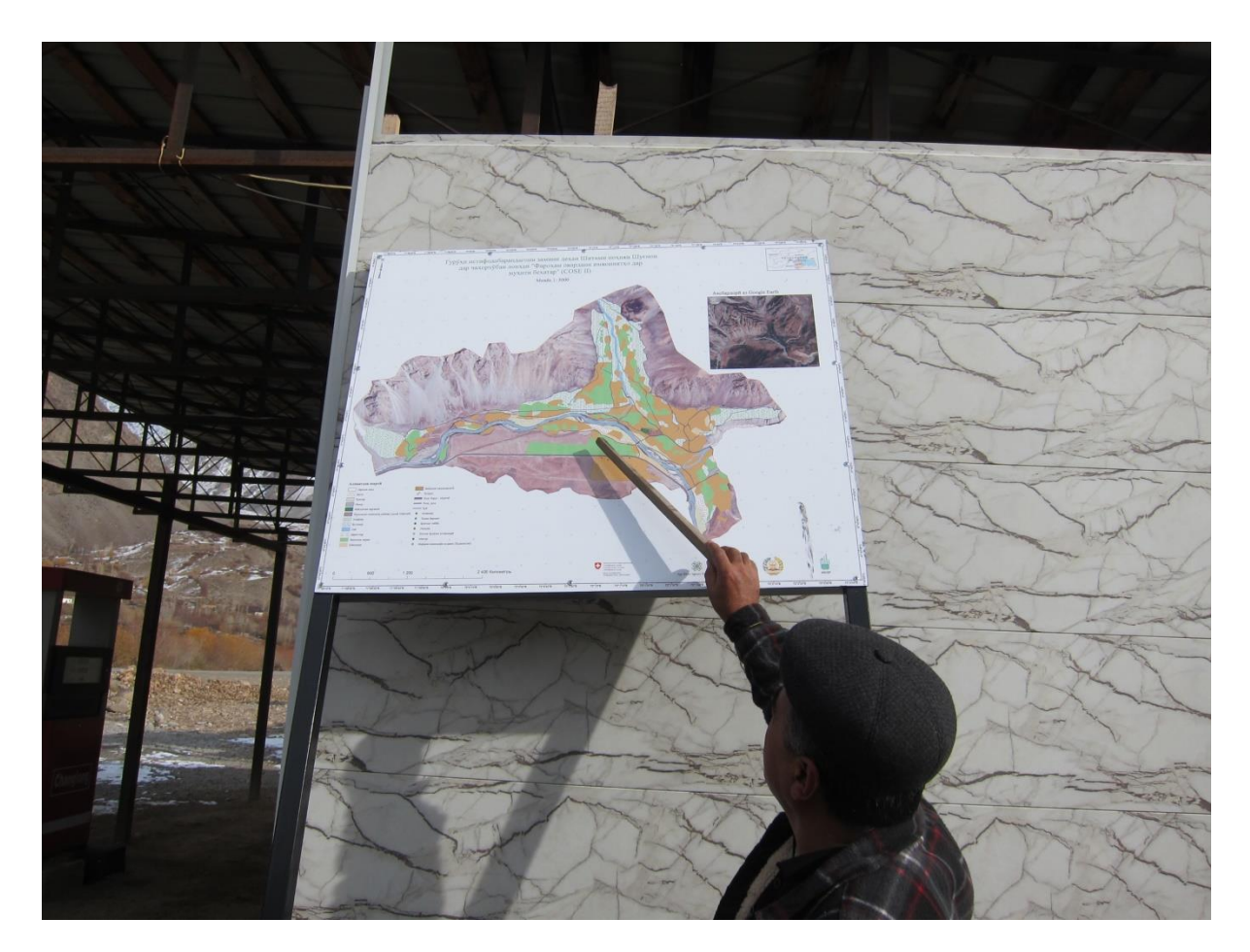
Fig. 5. Land use maps are an important tool for community-based management of NRM.

Overall assessment of sustainability: 4 (out of 6)