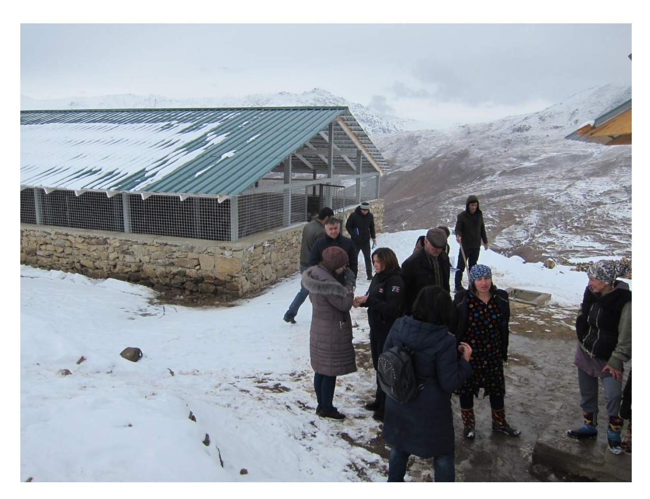
Fig. 3. Covered and fenced animal shed (protection from snow leopard and wolves attack) on Bodomdara pasture.

Overall assessment of relevance: 5 (out of 6)