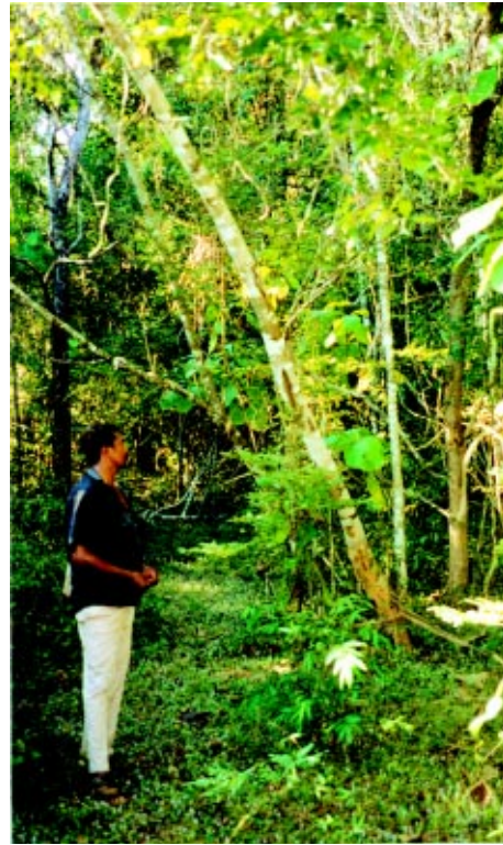
Fig. 2. Young dry forest of an area inhabited in the past. Note the teak trees reminiscent of the former village of Ampijoroa, abandoned 30 yr ago.

Plants of forest and thicket formations are very susceptible to fire damage, the trees and shrubs being generally thin-barked and with moderate or poor regeneration potential after damage (Langdale-Brown et al. 1964). At the beginning of the dry season dry forests usually do not burn and savanna fires stop at the forest boundary line. Later on in the dry season, the dry and continuous litter cover allows forest fires which may be very destructive to the forest. However, the frequency of